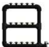
LATERAL INVERTIDA INVERTED SIDE