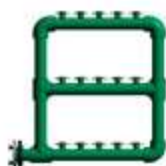
LATERAL INVERTIDA INVERTED SIDE