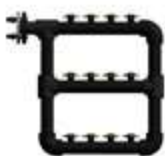
LATERAL SUPERIOR UPPER SIDE