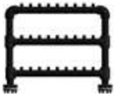
DOBLE TOMA DOUBLE INLET