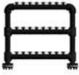
DOBLE TOMA DOUBLE INLET