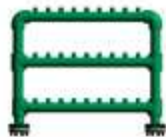
DOBLE TOMA DOUBLE INLET