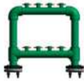
DOBLE TOMA DOUBLE INLET